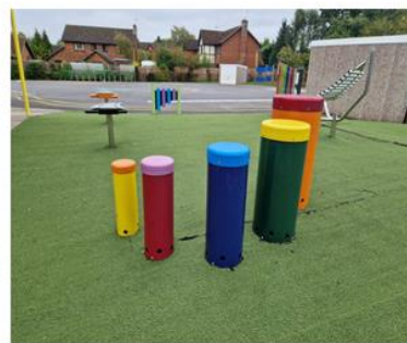
Outdoor musical instruments

In addition, we provide fun items for the children at various events... Commemorative pins to celebrate the Queens Jubilee, Bookmarks to celebrate the Kings Coronation, Christmas crackers for the school Christmas meal, ice lollies for every child on sports day and leaving gifts for Years 2 and 6.