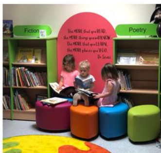
Refreshed the Infants School Library