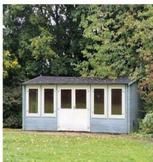
The Summer house