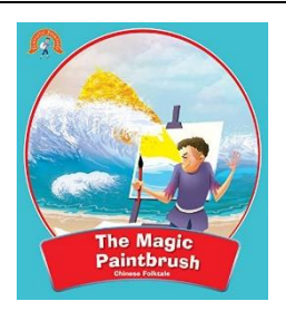
The Magic Brush (Pie Corbett)